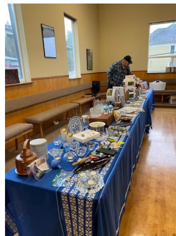
The Winter Nordic Market