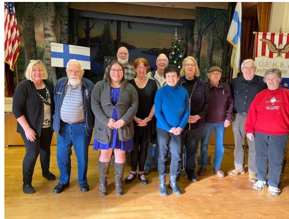
2020 Astoria Lodge Officers